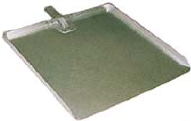
Aluminum Peel 32100030