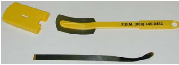
“Lames” with plastic handle “Lames” (blade not included)