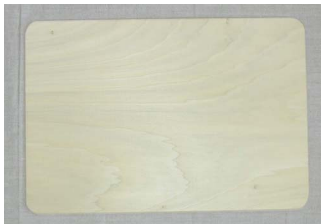
Proofing Board 32100031 or 32100050