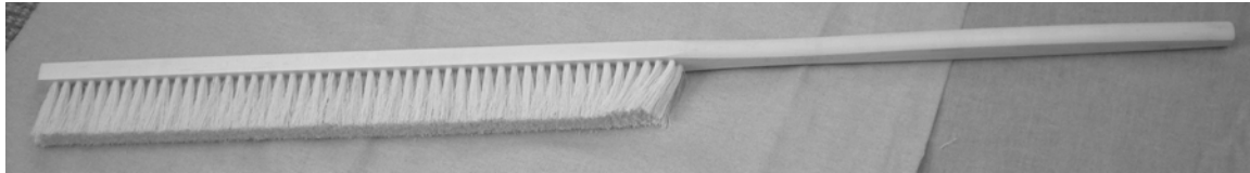
Oven Brush (51” long with handle)