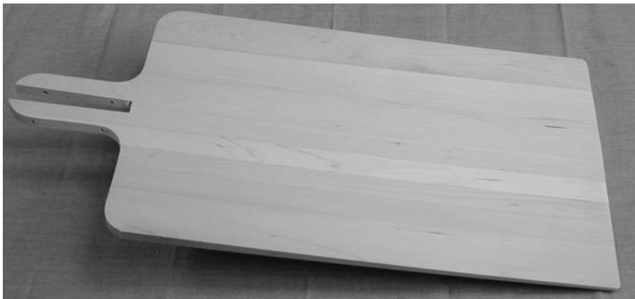
Oven Peel Board 32100029, 3210028, 32100049