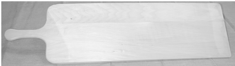
Oven Peel 103625