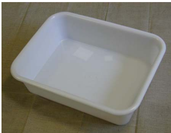
Rectangular Plastic Tub 510501