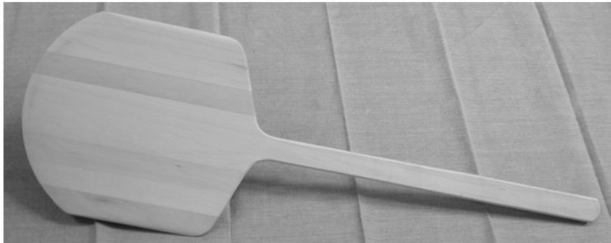
Oven Peel 123628