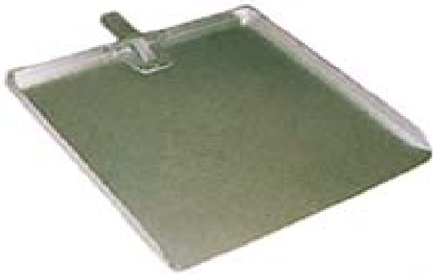
Aluminum Peel 32100030